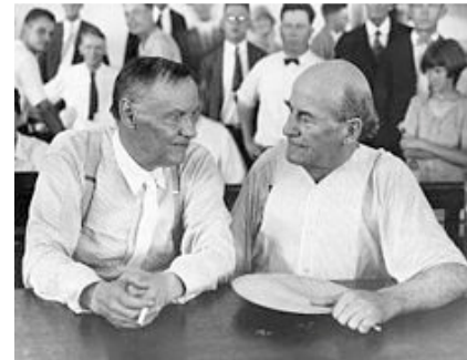
The Scopes Trial